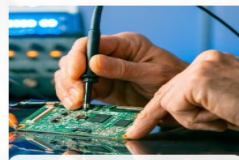
Test & Measurement