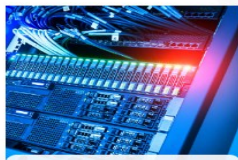
High End computing